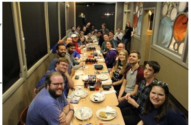
Right: Post-initiation IHOP