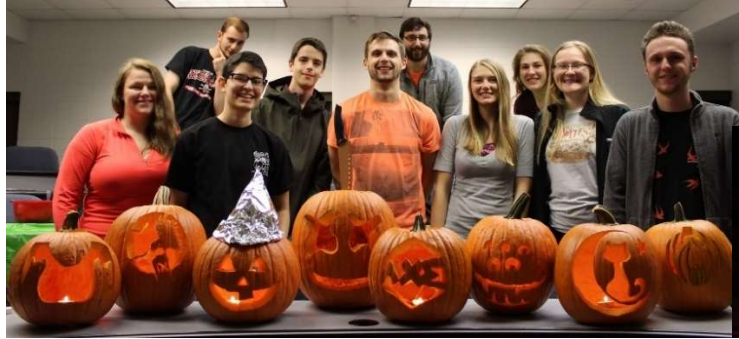
Pumpkin carving night!