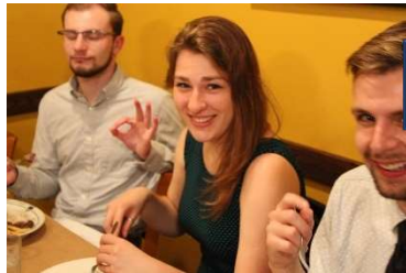
Fall Faculty Dinner!