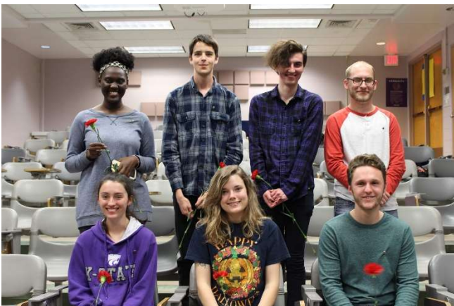
Left: Newly initiated brothers