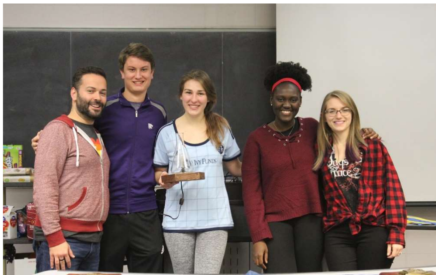
Family Flask Winners Fall 2018: